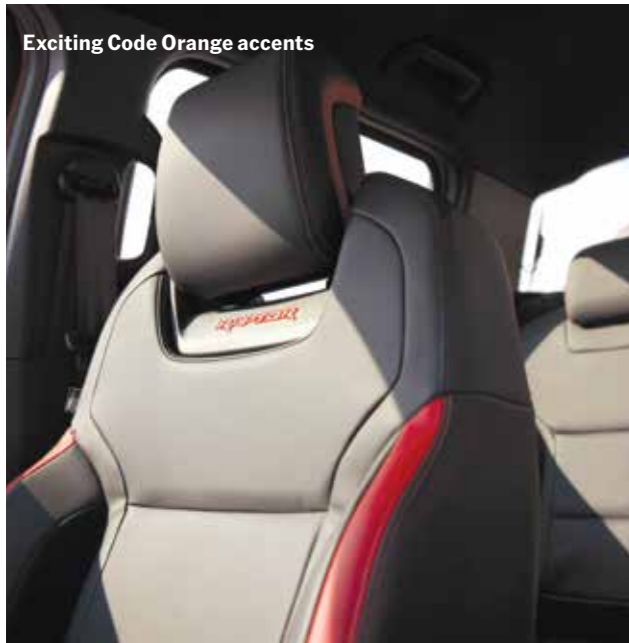
Exciting Code Orange accents