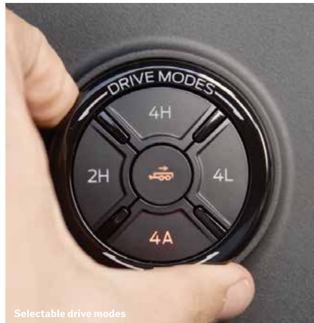
Selectable drive modes

Mated to a performance tuned 10-speed automatic transmission with a race-bred anti-lag system available in Baja mode improving acceleration out of corners.