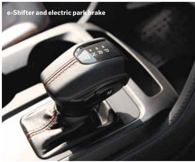
e-Shifter and electric park brake