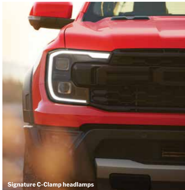
Signature C-Clamp headlamps