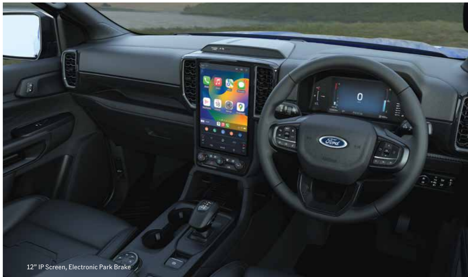
12" IP Screen, Electronic Park Brake