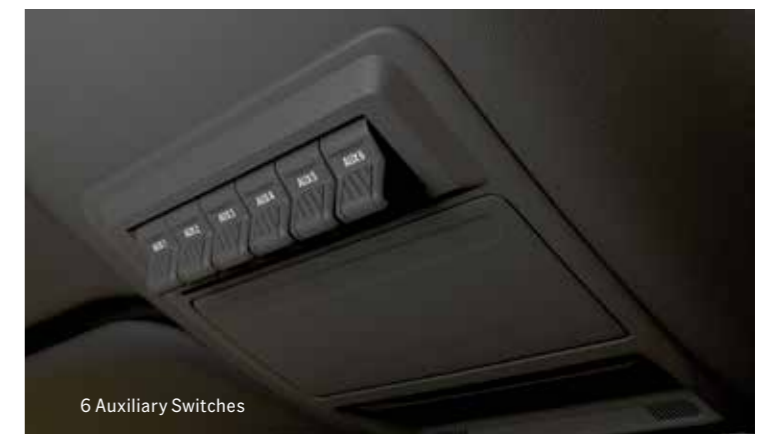
6 Auxiliary Switches