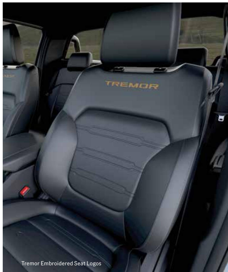
Tremor Embroidered Seat Logos

3.0L V6 Diesel 10-speed Automatic Transmission