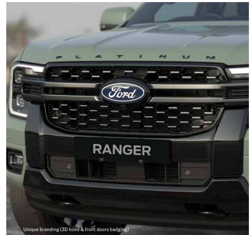
Unique branding (3D hood & front doors badging)