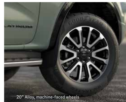
20" Alloy, machine-faced wheels