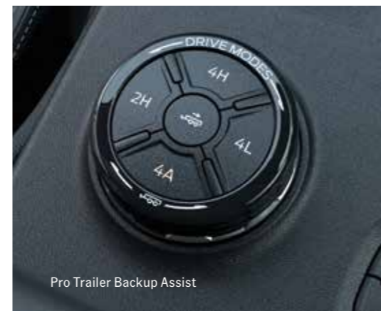
Pro Trailer Backup Assist