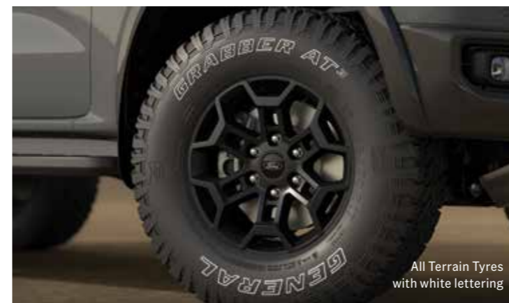
All Terrain Tyres with white lettering