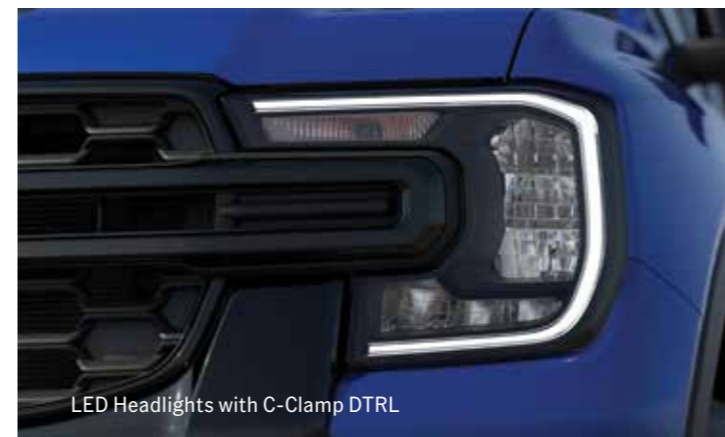
LED Headlights with C-Clamp DTRL