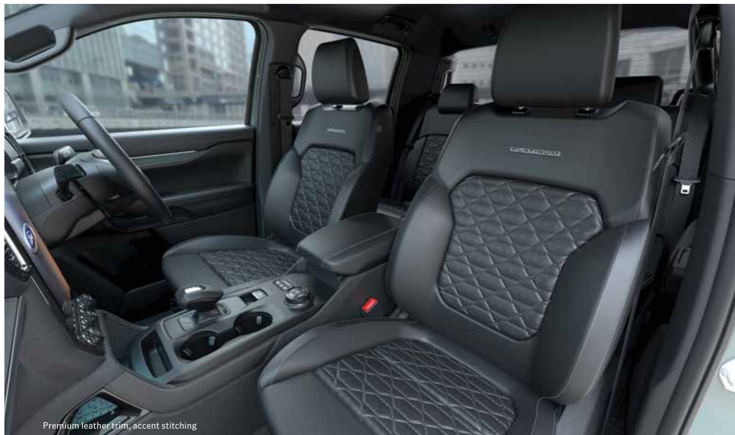
Premium leather trim, accent stitching

Ranger Platinum is all about having the luxuries of a premium SUV with the versatility of a pickup. The Ranger Platinum is the answer to an ever-growing market for luxury lifestyle bakkies.