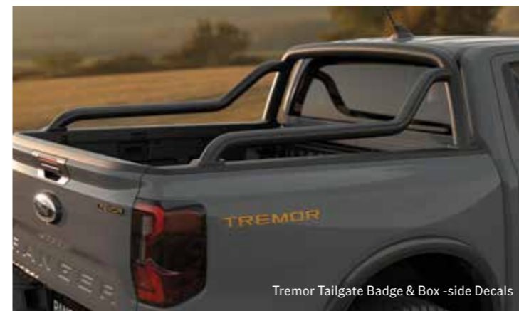
Tremor Tailgate Badge & Box-side Decals