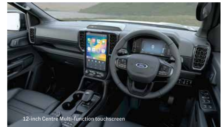
12-inch Centre Multi-function touchscreen