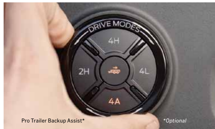
Pro Trailer Backup Assist* *Optional