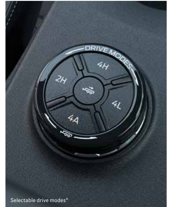
Selectable drive modes 4