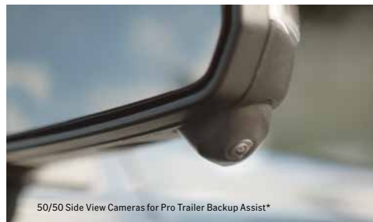
50/50 Side View Cameras for Pro Trailer Backup Assist*