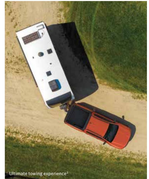
Ultimate towing experience 5