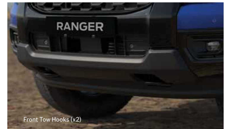
Front Tow Hooks (x2)